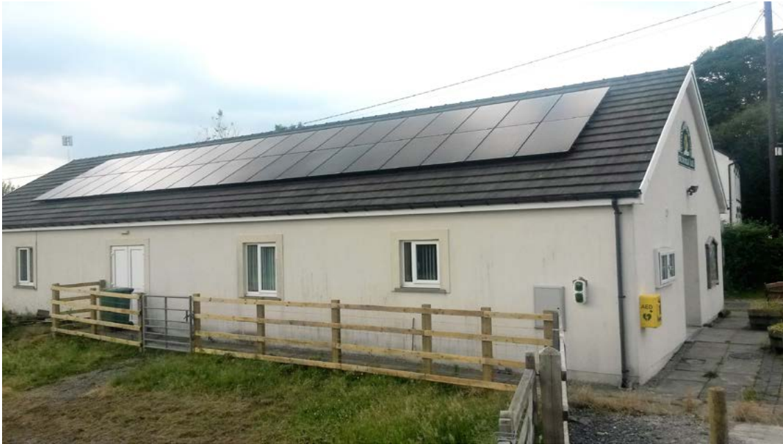
Exhibit 2: Salem Community Hall has benefitted from solar panels, car charging port and lithium ion battery capacity